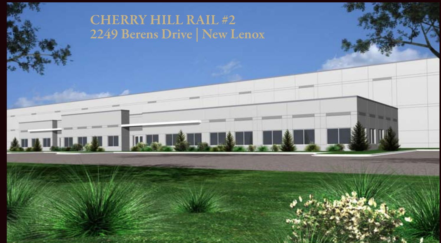
CHERRY HILL RAIL #2 2249 Berens Drive | New Lenox